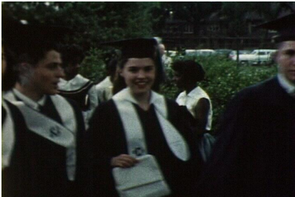
Cheaper Retail Store Film Transfer. Image was zoomed & cropped, colors are lost, contrast is too high.